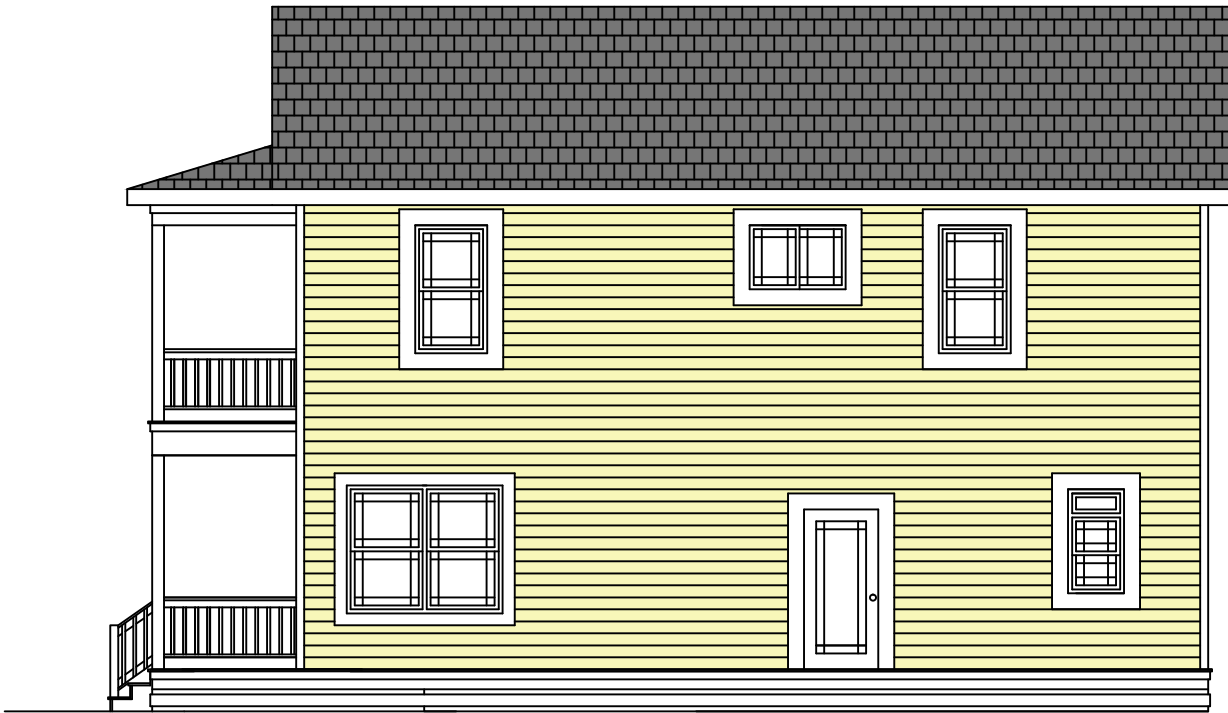
Right Elevation 1/8"=1'