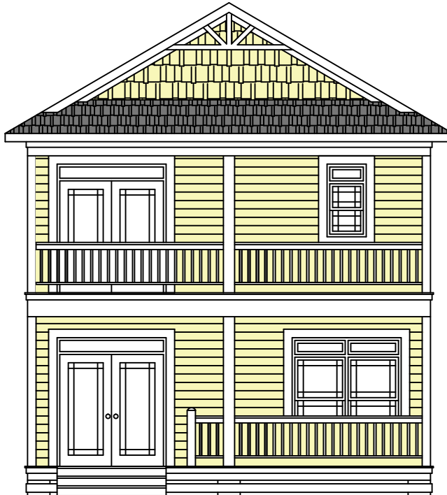
Front Elevation 1/8"=1'