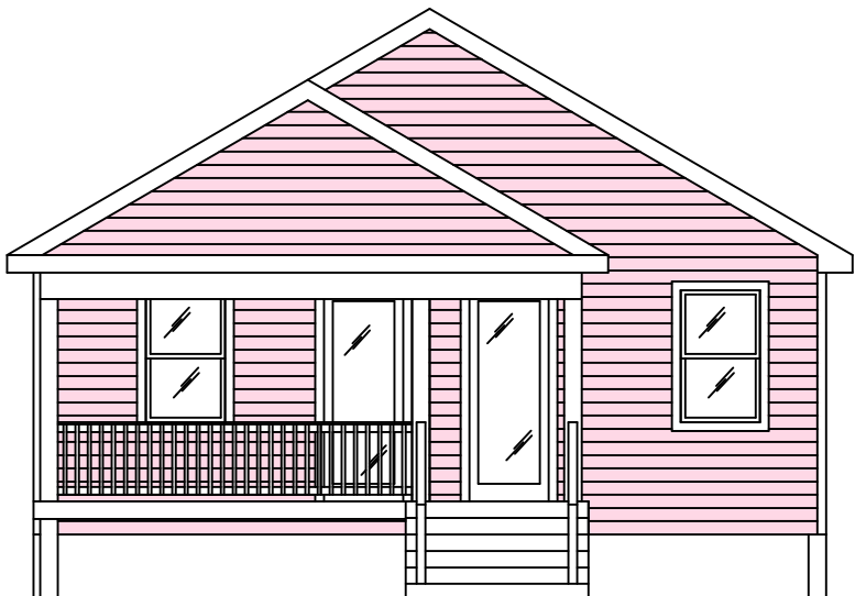
Front Elevation 1/8"=1'